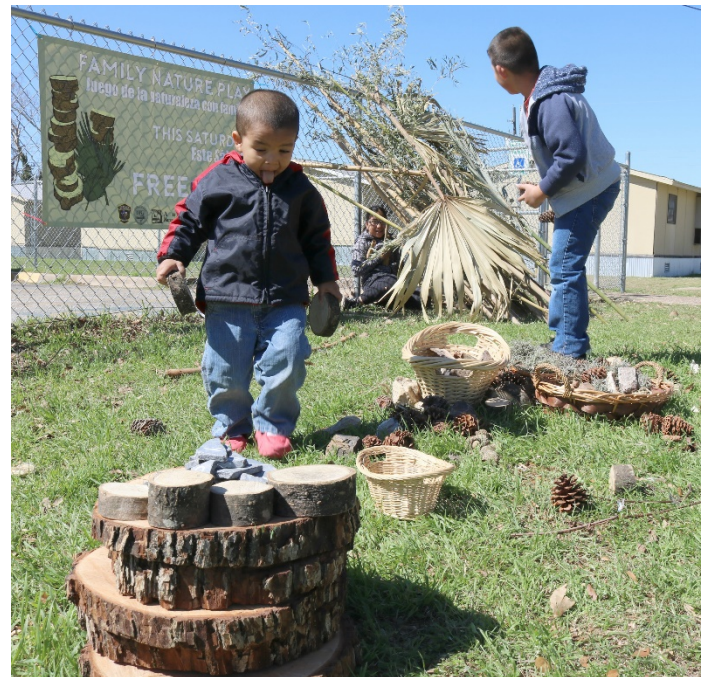
Nature play areas build family engagement in this Green School Park to aid the community design process.

To develop an understanding of the areas of most need in Austin, two models were developed using ArcGIS. The first model measures the nature quality of Austin's green spaces, and the second model measures the potential for impact within Austin's neighborhoods.