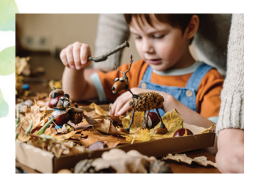
March 2021: Nature and art

In 2021 we surpassed 1,000 articles in our Research Library – and made the world's largest collection of nature connection research easier to access, search and categorize. With more than 60,000 pageviews per year, improvements to the tagging and search functionality of our Research Library connects organizations and researchers to the information they need to make the case for nature's benefits. We share the latest additions to the Library each month in themed Research Digests like these: