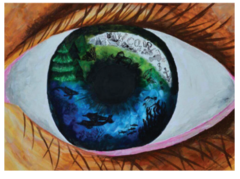
Nature Future: Kids' visions for a just and nature-filled world

We invited children and teens from around the world to share art and creative writing that expresses their love for the natural world, along with their thoughts, dreams, questions and concerns about the future. This online exhibit included a toolkit with lesson plans and tips for talking to kids about equitable nature access.