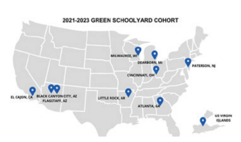
Cities take the lead in transforming schoolyards with nature to help kids thrive

More than 50 cities and school districts applied to be part of Cities Connecting Children to Nature's Green Schoolyards cohort. Eleven were chosen, each with a demonstrated commitment from their mayor and at least one school board official. They are bringing green schoolyards to scale with support of the Children & Nature Network and our partner, the National League of Cities.