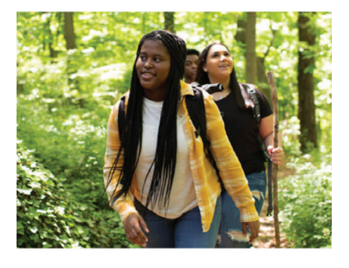
National Youth Development & Nature Cohort launched

In 2021, we welcomed nine organizations from across the U.S. to join our Youth Development & Nature Cohort designed to enhance local partnerships, build cultural awareness and engage youth in meaningful outdoor experiences.