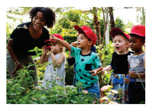
October 2021: Nature engagement during early childhood

This Digest reviews the health, wellbeing and developmental benefits of nature engagement for young children, from birth through age five.