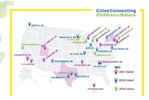
Cities Connecting Children to Nature: The momentum grows

What can the U.S. learn from other countries when it comes to greening schoolyards? In 2021, we launched the first phase of an 18-month project to find out. Our Global Lessons on Greening School Grounds © Outdoor Learning initiative, funded by the Robert Wood Johnson Foundation, will share case studies and data to establish a baseline of knowledge and a platform for advancing best practices for the green schoolyards movement in the U.S. and around the world.